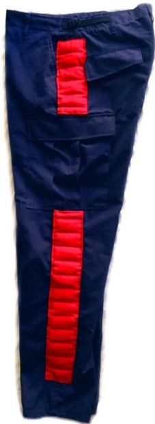
Outer leg panels