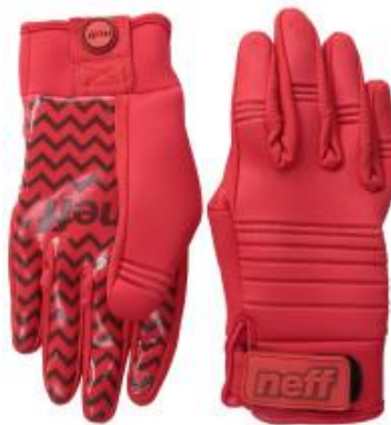
NEFF Daily Pipe Glove (Red)

The 1986 Viper V1 wore short (wrist-length) red gloves that matched the red forearm bracers. Please avoid long "gauntlet" gloves (which extend past the wrist and cover the forearms), and fingerless gloves. The recommended glove for male and female Vipers is the NEFF Daily Pipe Glove (red).