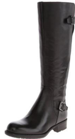
Franco Sarto Women's Perk Motorcycle Boot