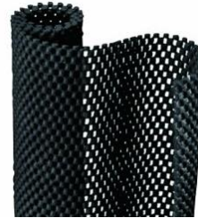
Non-skid cabinet liner for goggles strap