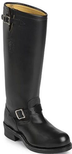
Men's Chippewa Police Motorcycle Boot (71418)

For male Vipers, recommended boots are Chippewa police motorcycle boots (71418), or AdTec Engineer Boots (1443). The recommended boots for female Vipers are the Franco Sarto Perk Motorcycle Boot (ASIN: B00NQ31YIA).