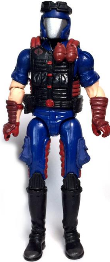
Version 20 (2009)