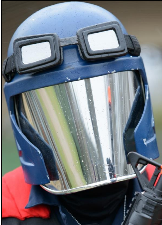
Basic V1 Helmet