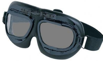
SSC Helmet Goggles:

Tip: to secure the goggles on the helmet, consider lining the inside of the elastic strap with multiple strips of black, non-skid cabinet liner (see photo). By using multiple strips, the goggles strap will retain its elasticity.