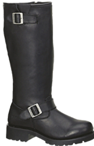
Men's AdTec Engineer Boot (1443)