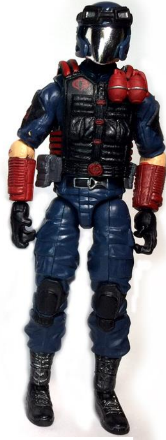
Version 28 (2011)