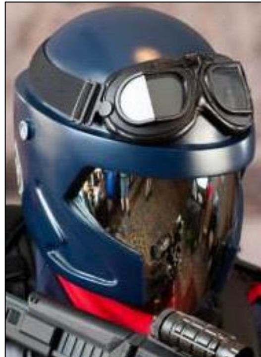
Sideshow Collectibles (SSC) Helmet

For Finest approval, the helmet must be visually identical to helmets already in service within the Finest ranks (ask a Garrison Commander or the Command Staff for vendors and availability). Currently, there are two styles of approved Viper helmets: