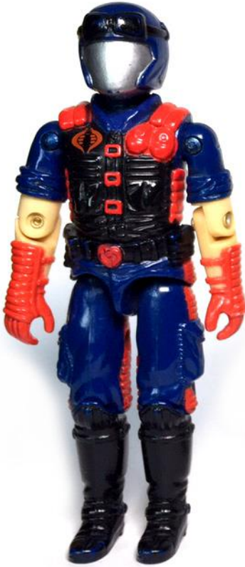
Version 1 (1986)