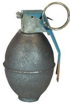
Unpainted “lemon” grenade

Two red grenades (lemon style) should be clipped onto the MOLLE webbing on the upper left chest of the vest. Inert lemon grenades are widely available at military surplus stores. The lemon grenades should be painted red to match the other red components of the uniform. Please avoid using other types of grenades, including “baseball” or “pineapple” style grenades. The grenades should be painted red to match the belt buckle and the red fabric components of the uniform.