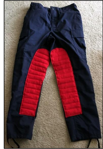
Inner leg panel with rounded top edge

Tip: For greater accuracy, dark navy piping may be used as trim around the red inner leg panel (see 1986 Viper V1 card art).