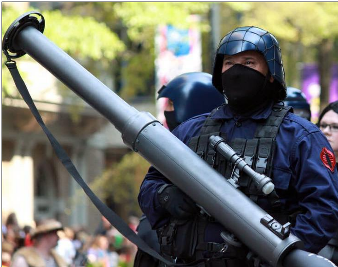
An example of customizing gear based upon Cobra MOS, this Trooper is outfitted as an anti-armor specialist.