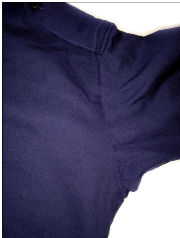
The other side is sewn along the shirt seams.