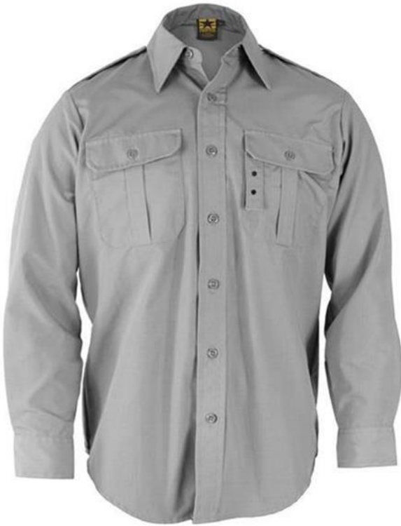
Propper (Grey) Tactical Dress Shirt

Regardless of which shirt you choose, the shirt should be tucked into the BDU trousers. Please avoid purchasing 4-pocket BDU shirts which are not intended to be tucked into BDU trousers.