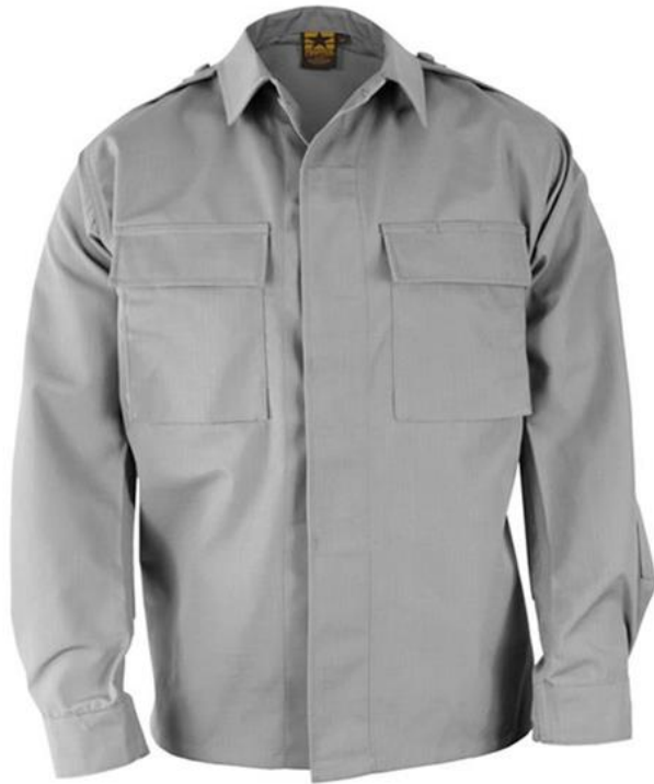
Propper (Grey) 2-Pocket BDU Shirt