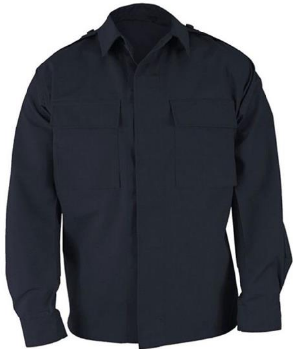
Propper (Dark Navy) 2-Pocket BDU Shirt