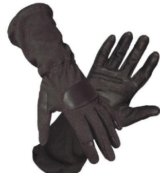
Hatch SOG Glove

To prevent skin showing at the wrists, long, gauntlet-style, tactical gloves are recommended.