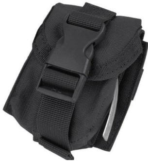
Condor Frag Grenade Pouch

Finest members are encouraged to select from the wide assortment of black Condor MOLLE-compatible tactical pouches, canteens, holsters, packs, and other items to create a customized gear load-out for their Officer or Trooper. Photos of possible gear combinations are included on this page.