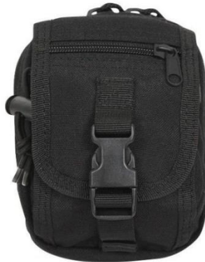
Condor Tactical Gadget Pouch