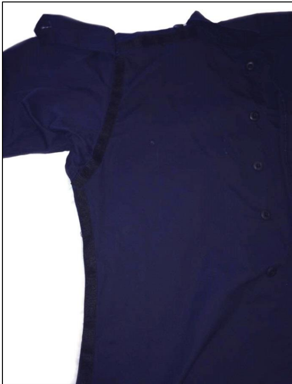
One side of the chest flap is secured by Velcro.

Tip: Online retailers will occasionally place larger size (2X-4X) Propper Dark Navy shirts on clearance for less than $10 (e.g., www.TacticalGear.com , and www.LAPoliceGear.com ).