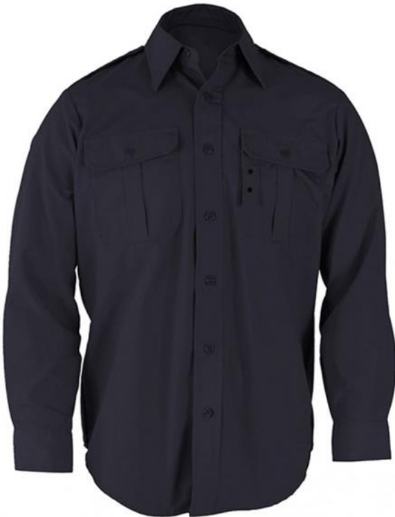
Propper (Dark Navy) Tactical Dress Shirt

Regardless of which shirt you choose, the shirt should be tucked into the BDU trousers. Please avoid purchasing 4-pocket BDU shirts which are not intended to be tucked into BDU trousers.